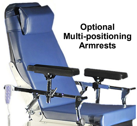
Optional Multi-positioning Armrests